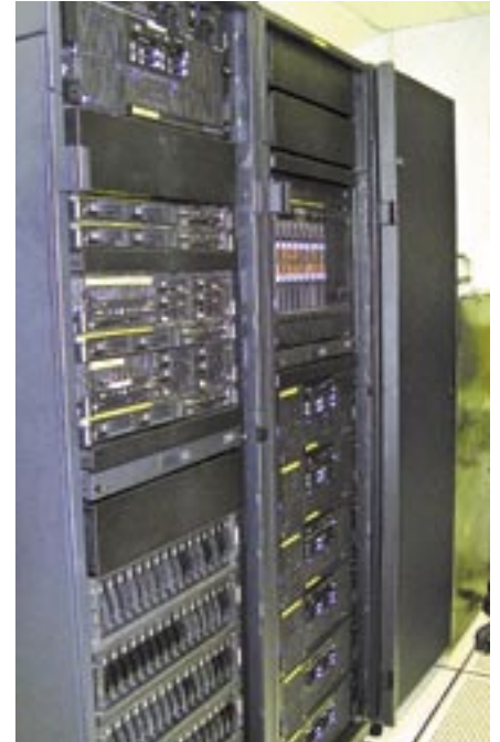
Some of the new hardware in situ.