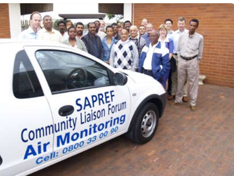
Photo taken in 2005 when delivery of the vehicle was taken