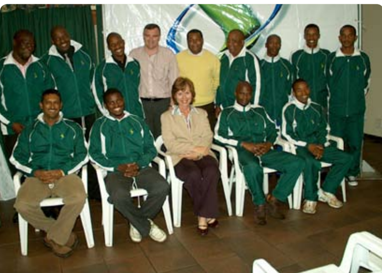
The first group of coaches who were trained.

The CLF Soccer Development was a pilot project aimed at unearthing and capitalizing soccer tal-